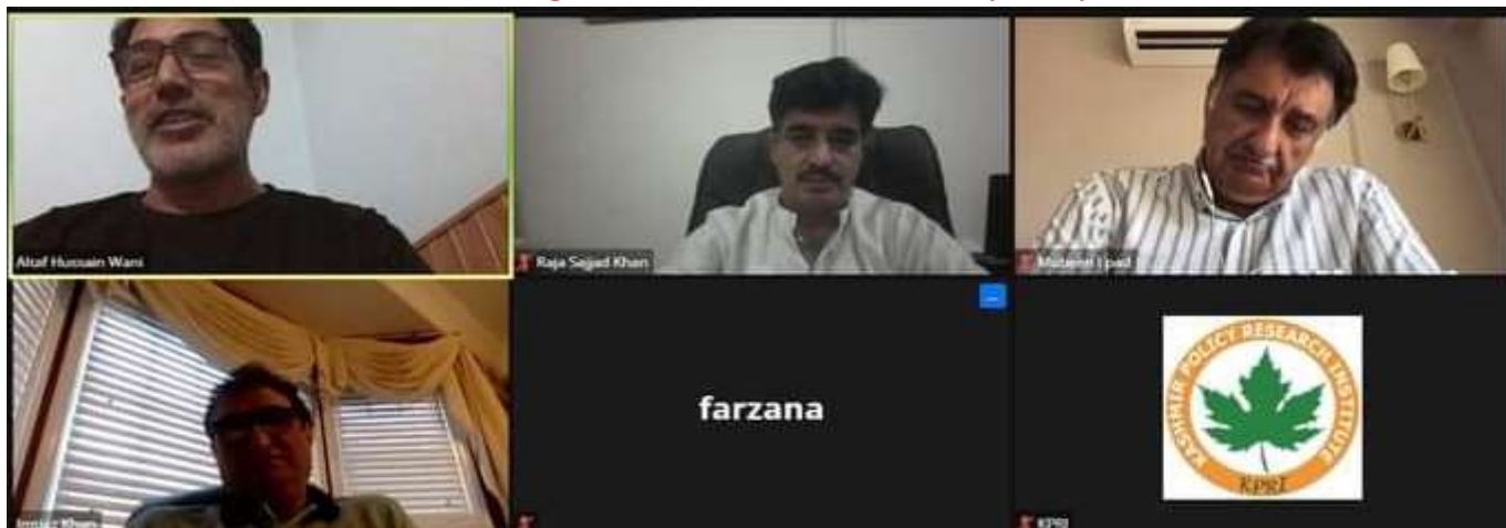
Webinar organized by KPRI on “Resistance in Jammu Kashmir against oppression and occupation”